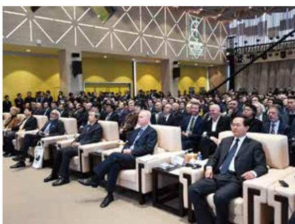
Minister of MIIT Miao Wei presided over the opening ceremony