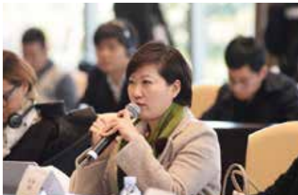
Maing Eunjoo Korea Institute of Design Promotion