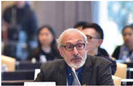
David Grossman International Council of Design