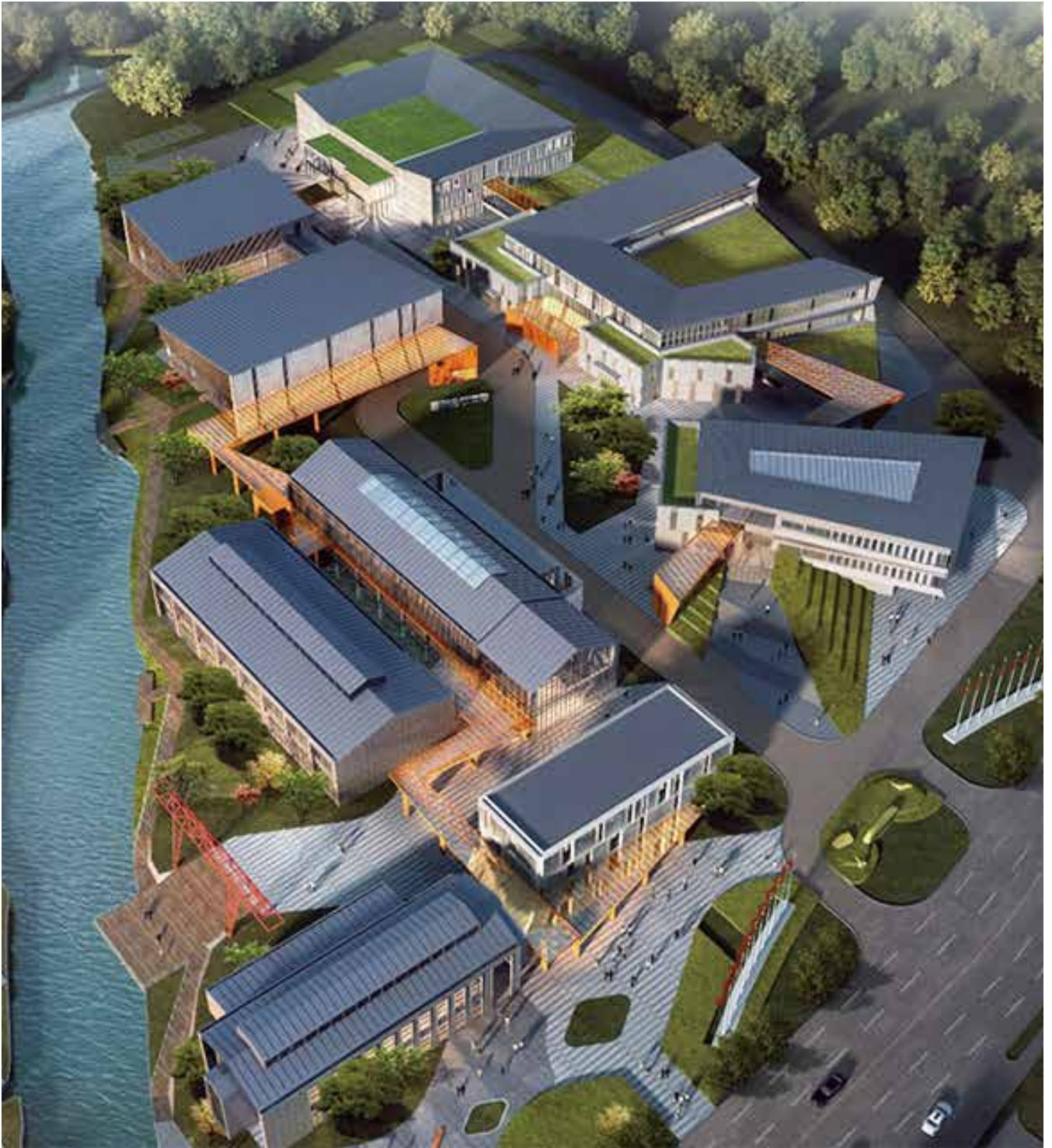
WIDC Conference Site