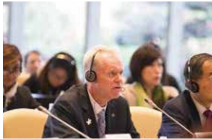
Günther Marten European Union Intellectual Property Office